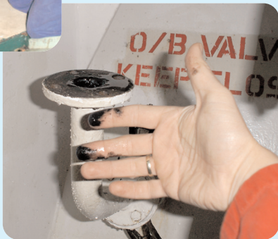
Oil found in overboard valve